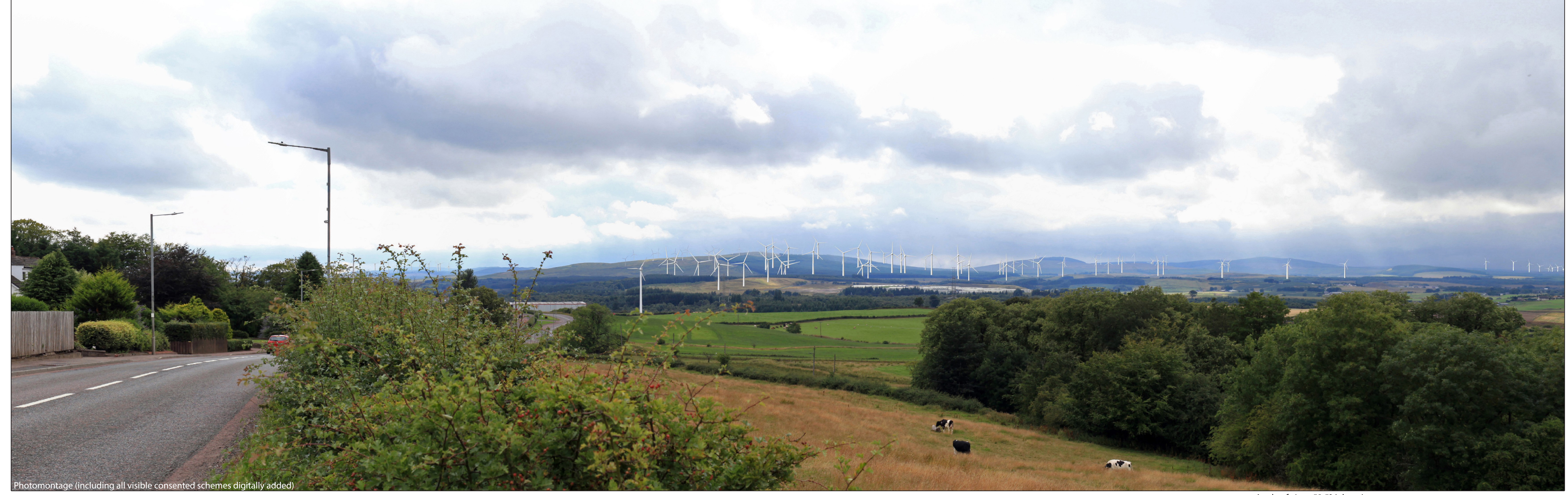
Figure 6.36 (sheet D) Viewpoint 5: A70 Rigside DOUGLAS WEST WIND FARM EXTENSION