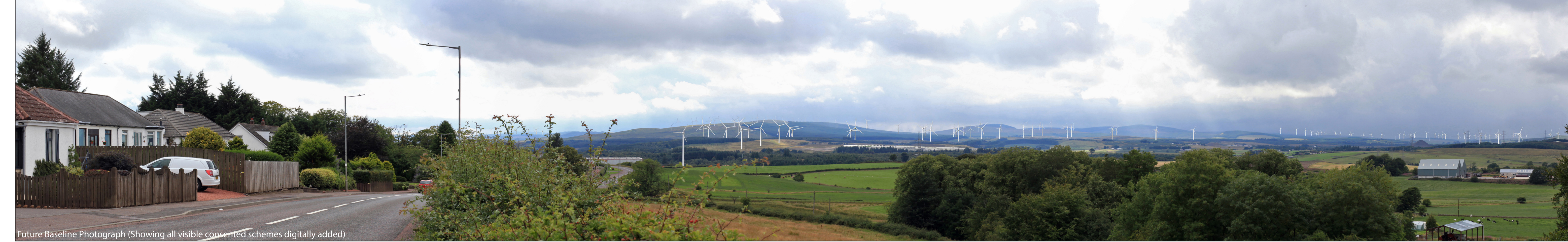
Figure 6.36 (sheet A) Viewpoint 5: A70 Rigside DOUGLAS WEST WIND FARM EXTENSION